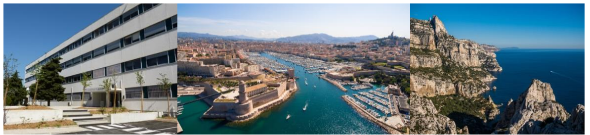
Left: the Fresnel Institute (30 minutes by bike or public transportation from the city center); Middle: the city center and old harbour, heart of Marseille; Right: the calanques, less than an hour by public transportation from the city center

On top of a thrilling research environment, the city of Marseille offers a high quality of life, with limited living costs and a unique combination of a culture and nature.